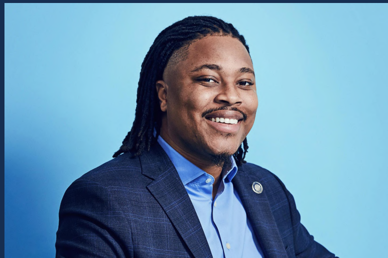
REP. MALCOLM KENYATTA FOR AUDITOR GENERAL