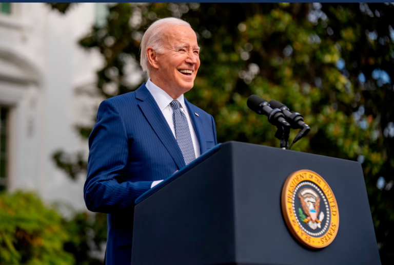
PRESIDENT JOE BIDEN FOR REELECTION