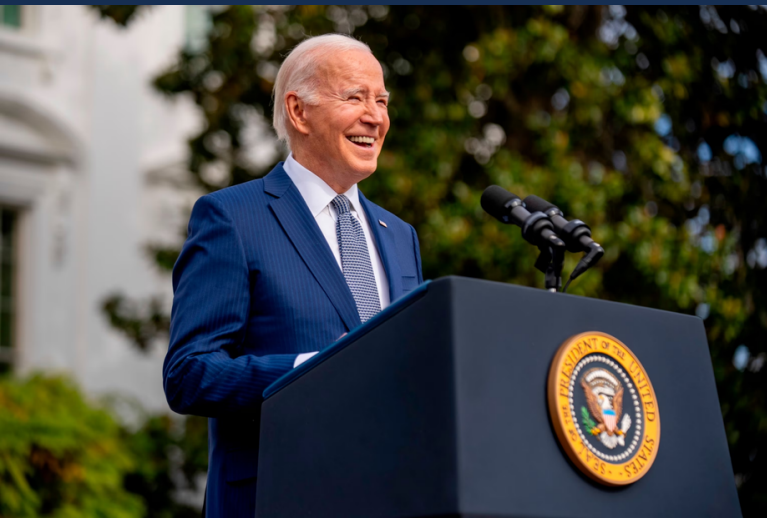
PRESIDENT JOE BIDEN FOR REELECTION